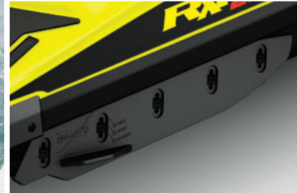
ADJUSTABLE REAR SPONSONS